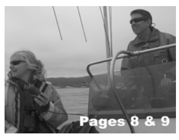
Sea Otter Surveying